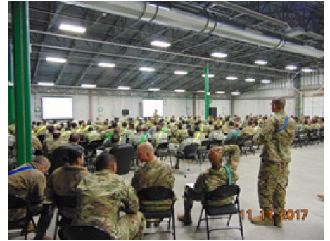
101st ESB Pre-Mobilization Training (PMT) Fort Indiantown Gap (FTIG) 5-19 NOV 2017