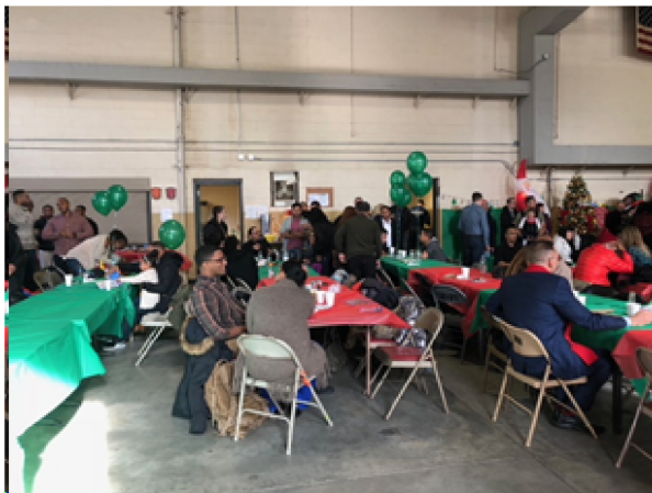
Holiday Party 2 DEC 17 Yonkers, NY