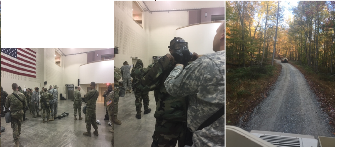
101st ESB Leader's Pre-Mobilization Training (PMT) Camp Smith Training Site 3-29 OCT 2017

CompTIA Security Plus course (28OCT-1NOV): The battalion successfully trained 16 personnel on Security Plus. The certification earned from successful completion of course and test will allow the battalion to perform its wartime mission.